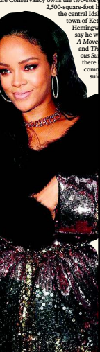
AS SEEN ON TV